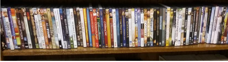
A great collection of uplifting DVD's

If you haven't been to our Library lately, now would be a great time to visit